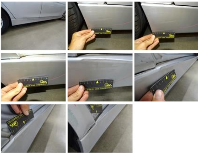
Wing R R, Dent(s) and scratch(es), LI - Repair and paint (complete) 308,20