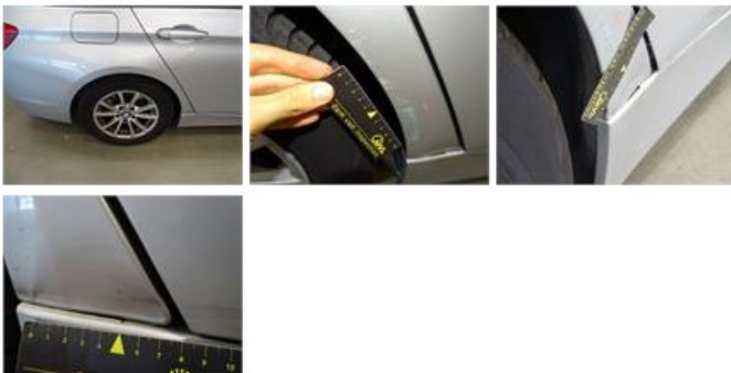
Rocker panel inner F R, Dent(s), LI - Repair and paint (complete) 115,56