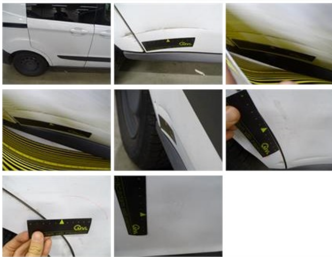
Wing R L, Dent(s) and scratch(es), LI - Repair and paint (complete)