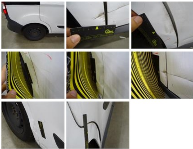
Wheel cover F L, Missing, E - Replace