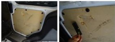
Trunk door R R, Scratch(es), Acceptable