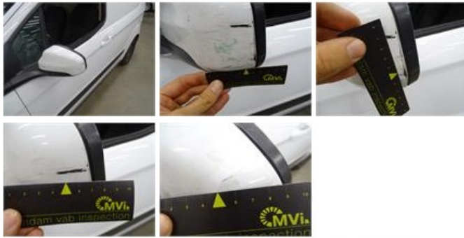
Rearview mirror housing R, Scratch(es), LI - Repair and paint (complete)