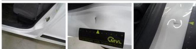
Wheel cover F R, Scratch(es), E - Replace