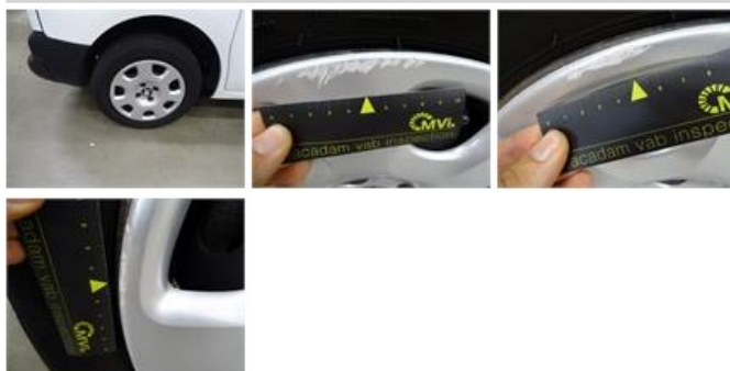
Wheel cover F L, Scratch(es), Acceptable