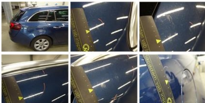
Rearview mirror housing L, Scratch(es), Acceptable