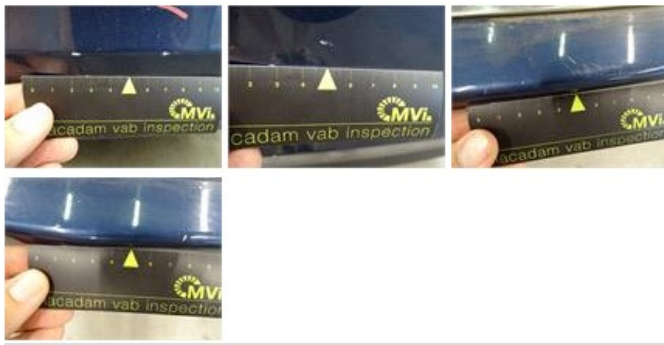
Bonnet, Chemical polution, LI - Repair and paint (complete)