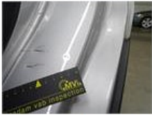
Rocker panel inner F R, Dent(s), LI - Repair and paint (complete)