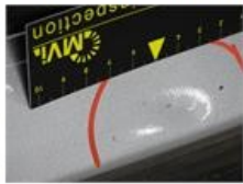
Alloy rim F R, Scratch(es), LI - Repair and paint (complete)