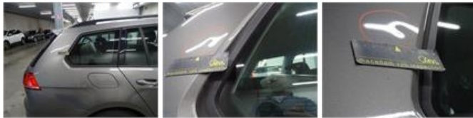
Roof, Dent(s), Acceptable