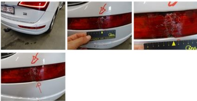
Bumper F, Scratch(es), Acceptable