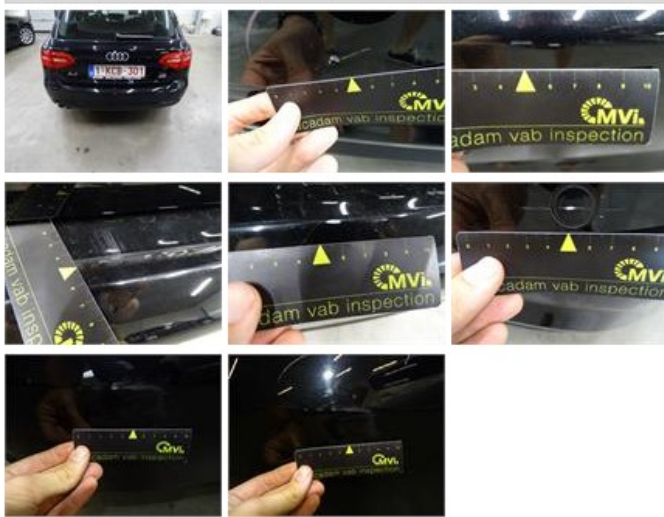
Door R L, Chemical polution, LI - Repair and paint (complete)