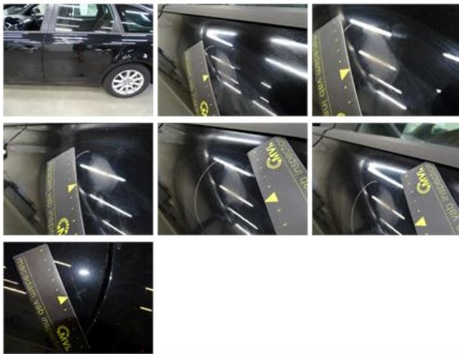
Wing R L, Chemical polution, Acceptable