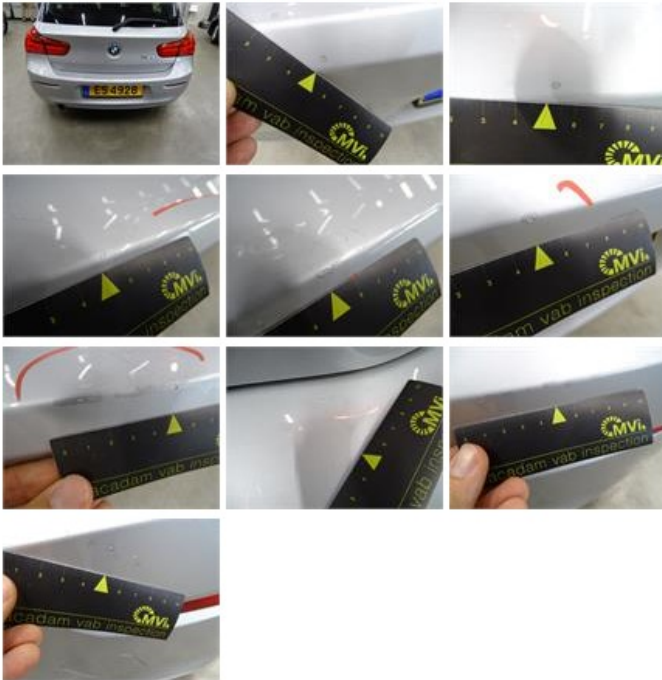
Bonnet, Dent(s) and scratch(es), LI - Repair and paint (complete)