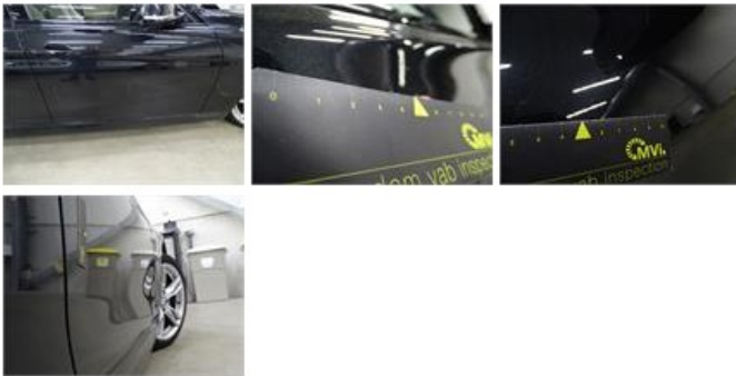
Door R L, Bad repair, Acceptable 0,00