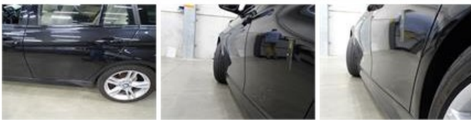
Rearview mirror housing L, Scratch(es), Acceptable 0,00