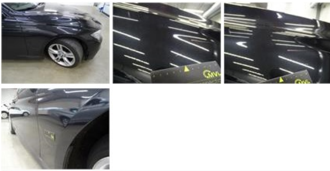
Door F R, Bad repair, Acceptable 0,00