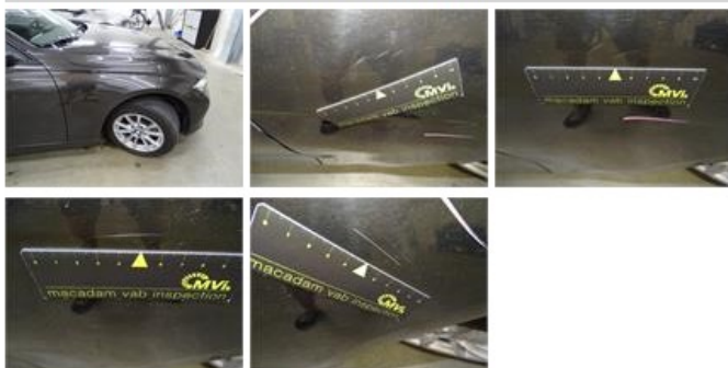
Wing R R, Dent(s) and scratch(es), LI - Repair and paint (complete)