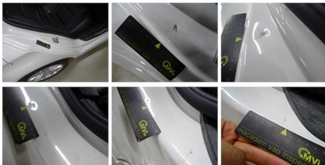
Door F L, Scratch(es), LI - Repair and paint (complete)