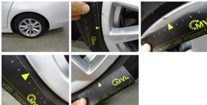
Alloy rim F L, Scratch(es), LI - Repair and paint (complete)