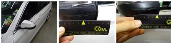
Door R R, Bad repair, Acceptable