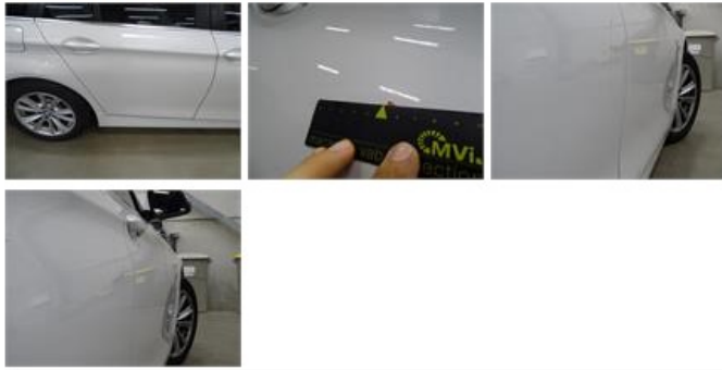
Alloy rim R L, Scratch(es), LI - Repair and paint (complete)