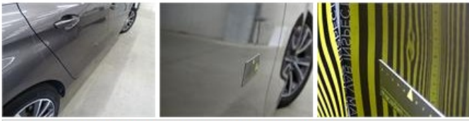
Bonnet, Chemical polution, LI - Repair and paint (complete)