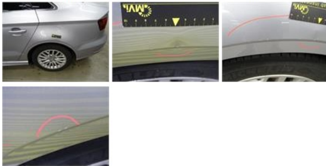
Bumper R, Scratch(es), LI - Repair and paint (complete)