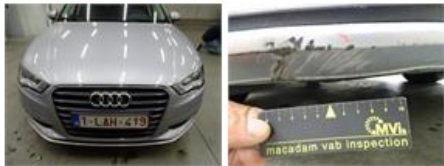
Wing R L, Dent(s) and scratch(es), LI - Repair and paint (complete)