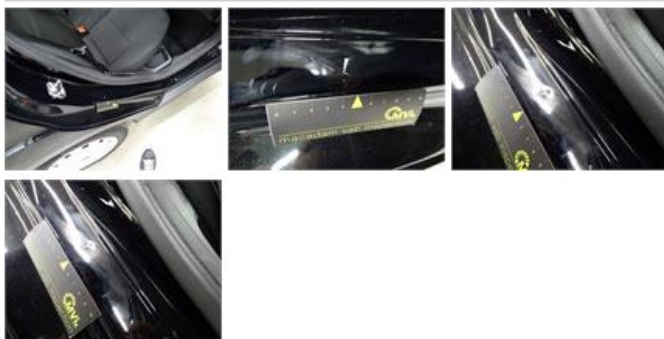
Wheel cover F R, Scratch(es), E - Replace