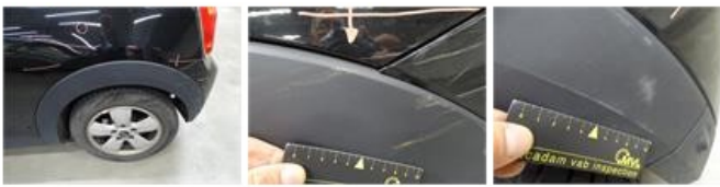
Door F R, Dent(s) and scratch(es), LI - Repair and paint (complete)