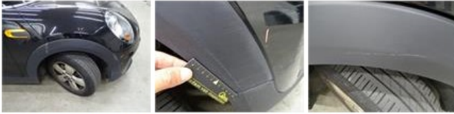
Wing R R, Dent(s) and scratch(es), LI - Repair and paint (complete) 308,20