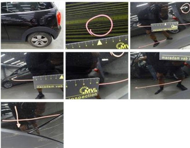
Bumper F, Scratch(es), LI - Repair and paint (complete)