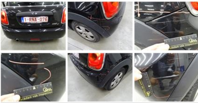
Wing F R, Scratch(es), It - Spot repair 115,56