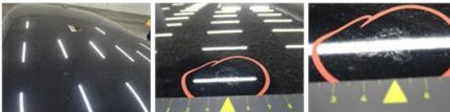
Wing R L, Dent(s) and scratch(es), LI - Repair and paint (complete)