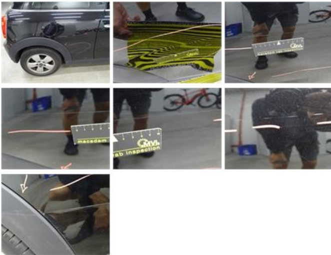
Alloy rim F R, Scratch(es), LI - Repair and paint (complete) 95,00