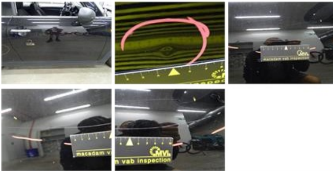
Rearview mirror housing R, Scratch(es), Smart repair