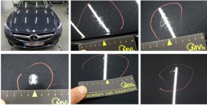
Door F L, Scratch(es), Acceptable