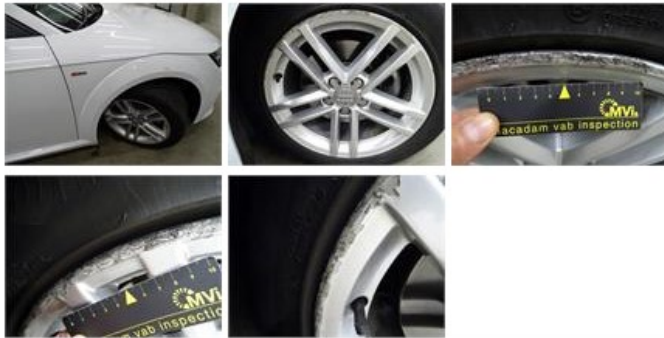
Alloy rim F L, Scratch(es), Acceptable