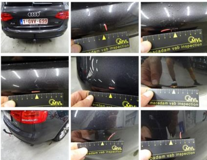
Door R R, Scratch(es), LI - Repair and paint (complete)