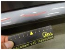
Roof, Chemical polution, LI - Repair and paint (complete)