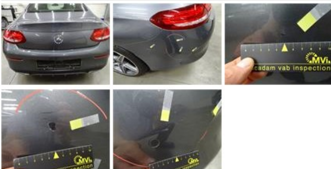
Sill outer L, Scratch(es), LI - Repair and paint (complete)