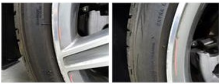
Alloy rim R L polished, Scratch(es), LI - Repair and paint (complete)