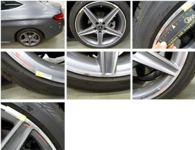
Alloy rim F L polished, Scratch(es), LI - Repair and paint (complete)