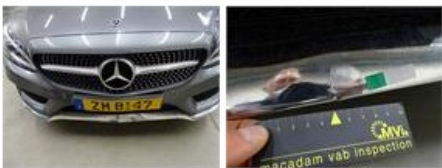
Door F R, Scratch(es), Acceptable