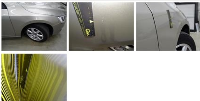
Bonnet, Repaired, Acceptable