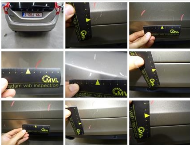
Door F L, Dent(s) and scratch(es), LI - Repair and paint (complete)