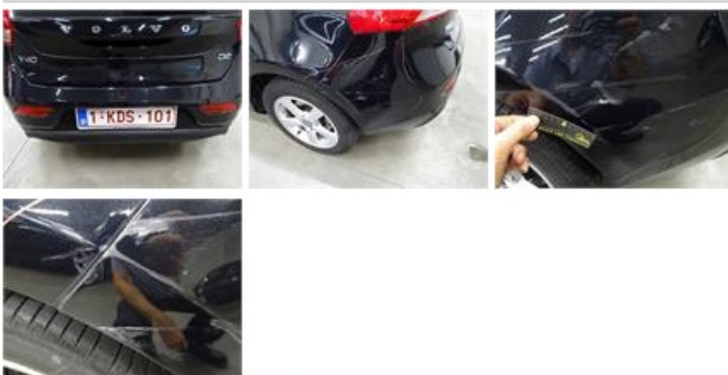
Alloy rim R R, Scratch(es), LI - Repair and paint (complete)