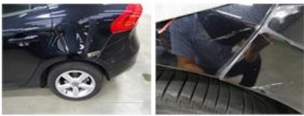
Door R L, Scratch(es), Acceptable