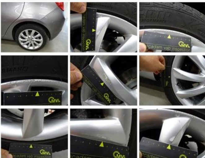
Sill outer L, Dent(s) and scratch(es), LI - Repair and paint (complete)