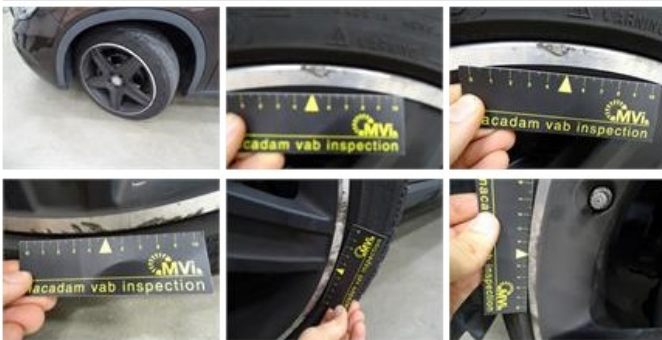
Alloy rim R R polished, Scratch(es), LI - Repair and paint (complete) 95,00