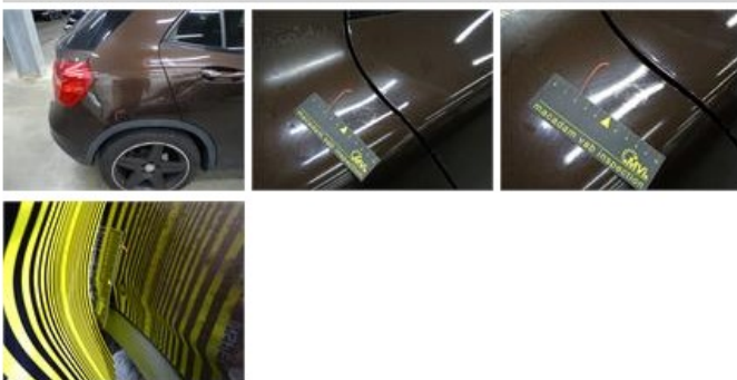
Door F R, Scratch(es), Acceptable 0,00