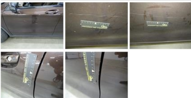
Wing R R, Chemical polution, LI - Repair and paint (complete) 369,84