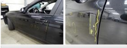
Door R R, Scratch(es), LI - Repair and paint (complete) 318,35