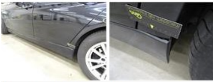
Door R L, Scratch(es), Acceptable 0,00