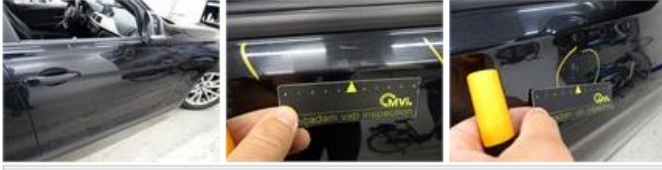
Bonnet, Chemical polution, LI - Repair and paint (complete) 290,08