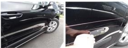
Door R R, Scratch(es), LI - Repair and paint (complete)