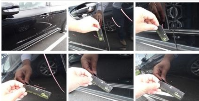
Wing F R, Scratch(es), Acceptable