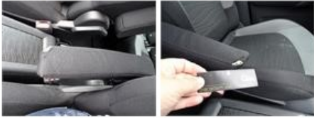
Seat cover R L, Burned, Smart repair