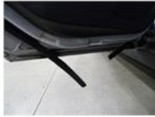
Bumper trim R, Scratch(es), Smart repair