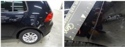
Door F L, Scratch(es), Acceptable