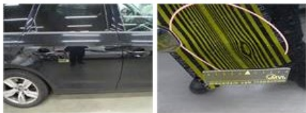
Wing F L, Scratch(es), Acceptable