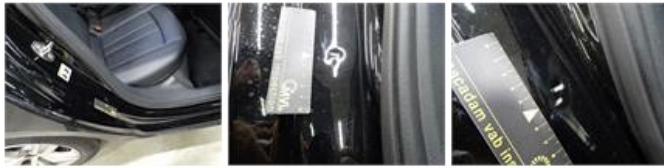
Tailgate, Chemical polution, LI - Repair and paint (complete)