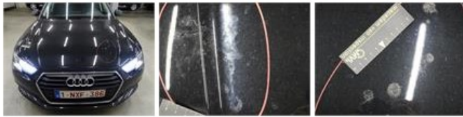
Bumper F, Scratch(es), LI - Repair and paint (complete)