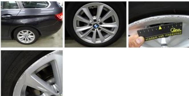
Wing R R, Dent(s) and scratch(es), LI - Repair and paint (complete)