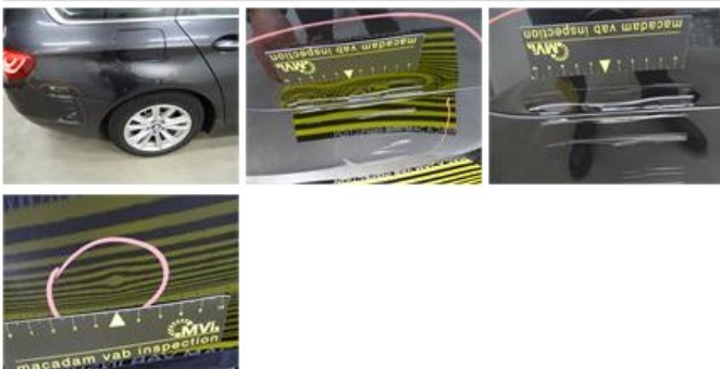
Door R L, Scratch(es), Acceptable