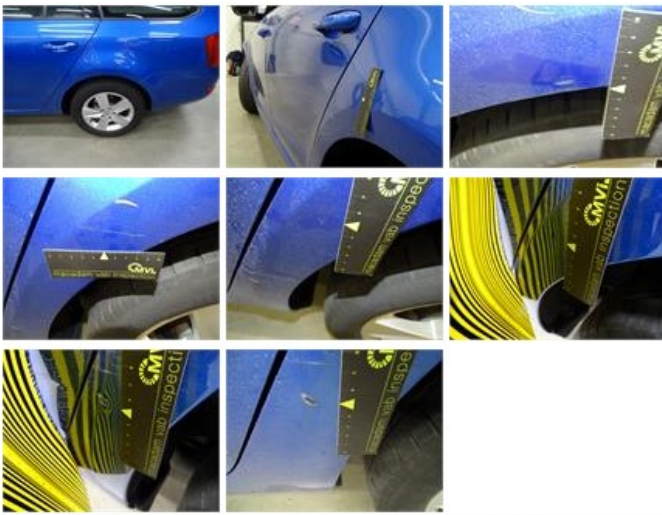
Door R R, Dent(s) and scratch(es), LI - Repair and paint (complete)