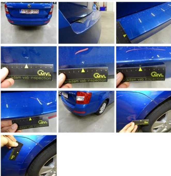
Door F R, Scratch(es), Acceptable