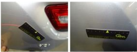
Bonnet, Dent(s) and scratch(es), LI - Repair and paint (complete)