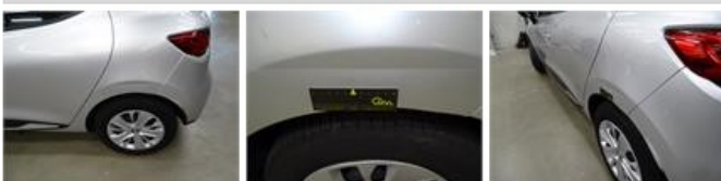
Door R R, Dent(s) and scratch(es), LI - Repair and paint (complete)