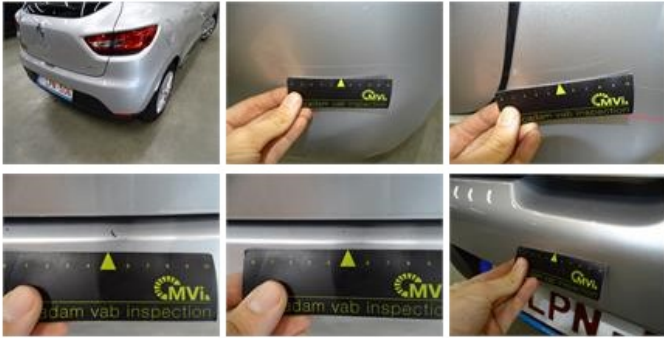
Wing R R, Dent(s) and scratch(es), LI - Repair and paint (complete)