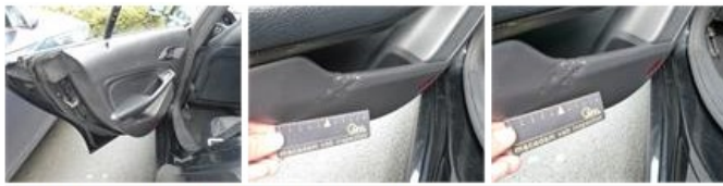
Wing R R, Dent(s), PDR - Paintless dent repair