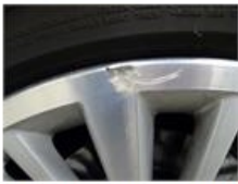
Alloy rim F R, Scratch(es), E - Replace