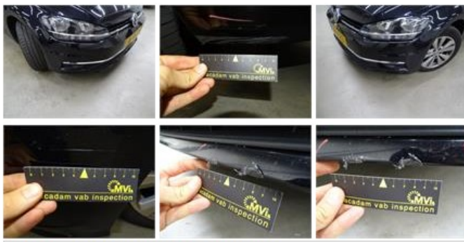
Trunk lid covering R, Scratch(es), Smart repair