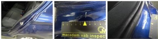
Bonnet, Chemical polution, LI - Repair and paint (complete)