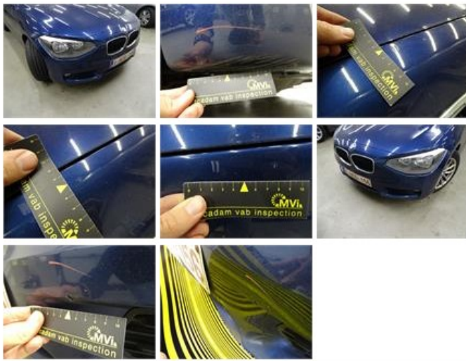
Bumper R, Dent(s) and scratch(es), LI - Repair and paint (complete)