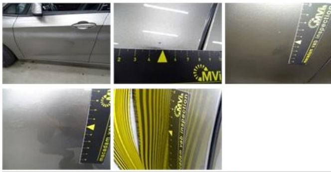
Roof, Chemical polution, LI - Repair and paint (complete)