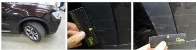
Door R R, Dent(s) and scratch(es), LI - Repair and paint (complete)