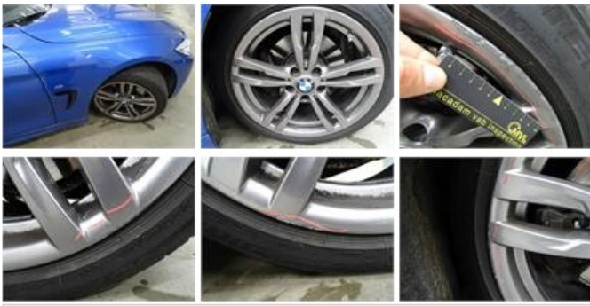
Alloy rim F L, Scratch(es), LI - Repair and paint (complete)