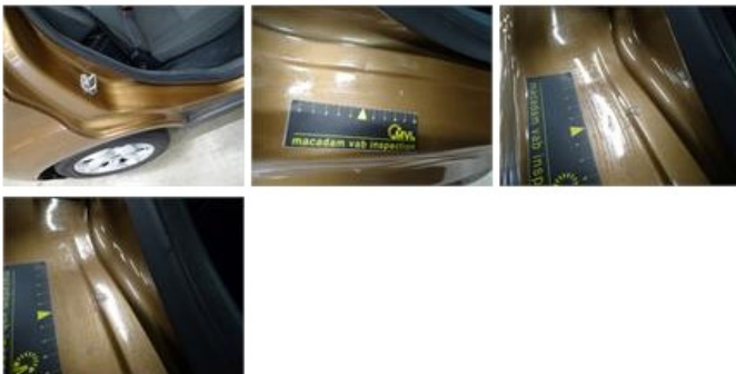
Door R L, Scratch(es), Acceptable