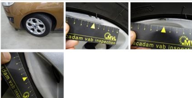
Door F L, Scratch(es), Acceptable