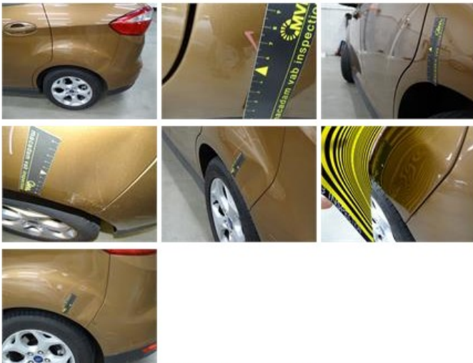
Rocker panel inner R L, Dent(s), LI - Repair and paint (complete) 115,56