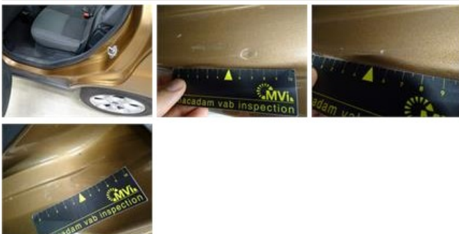
Door panel R L, Worn, Acceptable 0,00