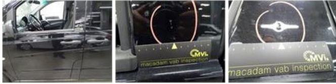
Roof, Dent(s), PDR - Paintless dent repair