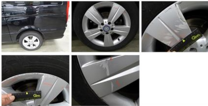
Alloy rim R R, Scratch(es), LI - Repair and paint (complete)