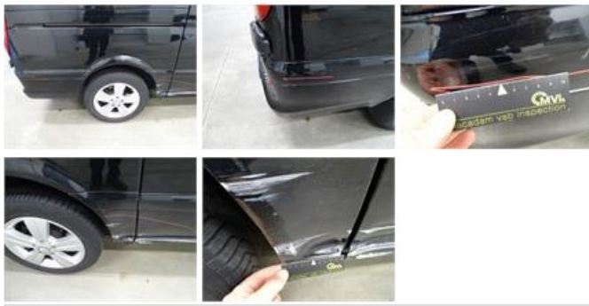
Door F L, Dent(s) and scratch(es), It - Spot repair