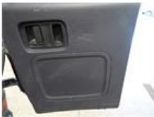
Bumper R, Dent(s) and scratch(es), LI - Repair and paint (complete)