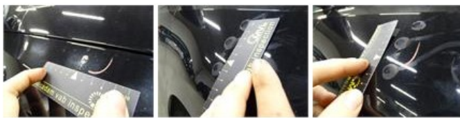
Wing R R, Dent(s) and scratch(es), LI - Repair and paint (complete)