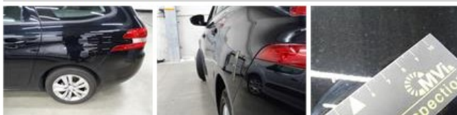
Door F L, Scratch(es), Acceptable