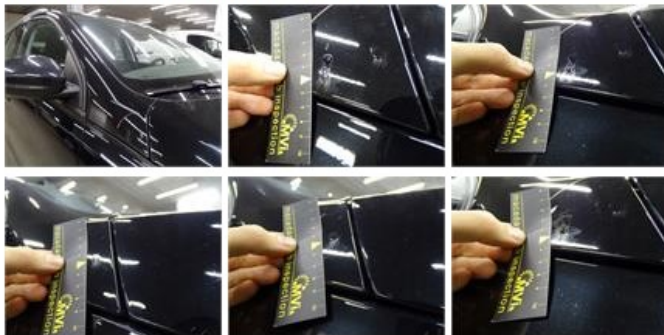
Roof pillar L, Dent(s), Acceptable