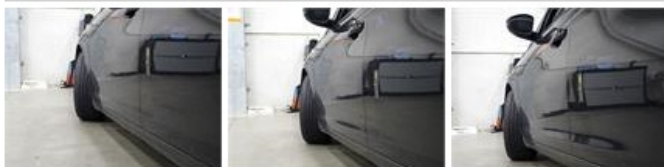
Alloy rim F L, Scratch(es), LI - Repair and paint (complete)