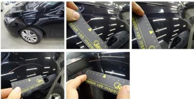
Door F R, Repaired, Acceptable