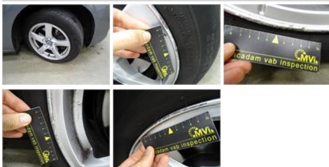
Alloy rim R R, Scratch(es), Acceptable