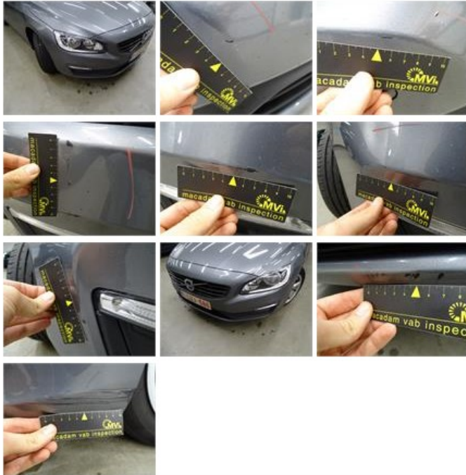
Wing R R, Dent(s) and scratch(es), LI - Repair and paint (complete)