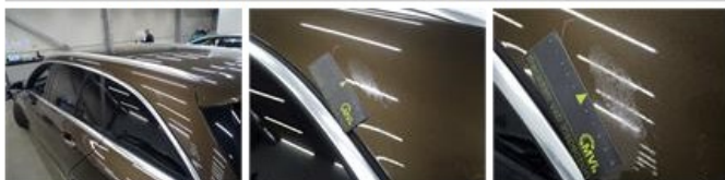
Wing R L, Scratch(es), Acceptable