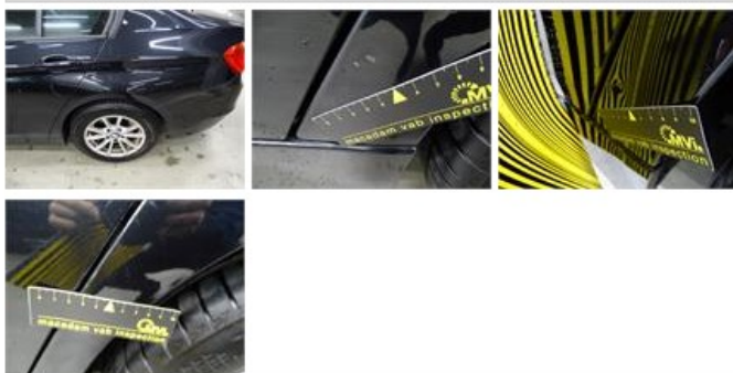
Door R L, Dent(s) and scratch(es), Acceptable