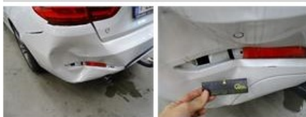
Wing R R, Scratch(es), Acceptable