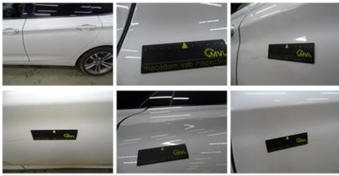
Alloy rim R L polished, Scratch(es), LI - Repair and paint (complete)