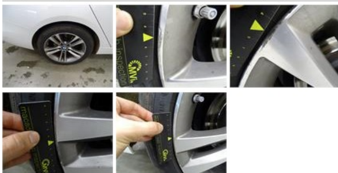
Alloy rim F R polished, Scratch(es), LI - Repair and paint (complete)