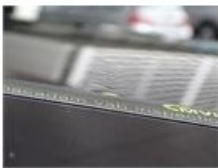
Reflector, Broken, E - Replace