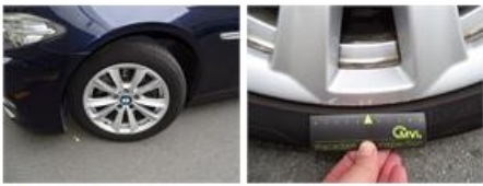
Alloy rim R R, Scratch(es), Acceptable