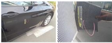
Door R L, Dent(s) and scratch(es), LI - Repair and paint (complete)