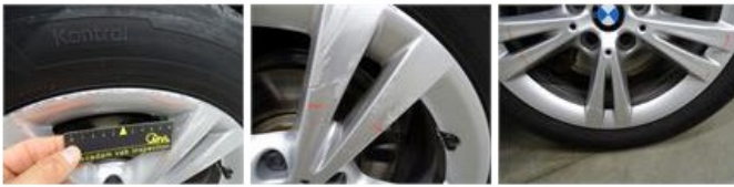
Alloy rim F R, Scratch(es), LI - Repair and paint (complete)