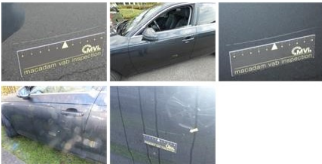
Wing F R, Scratch(es), Acceptable