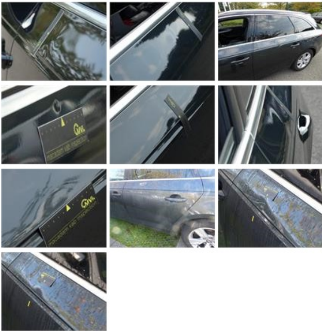
Rear window, Scratch(es), E - Replace