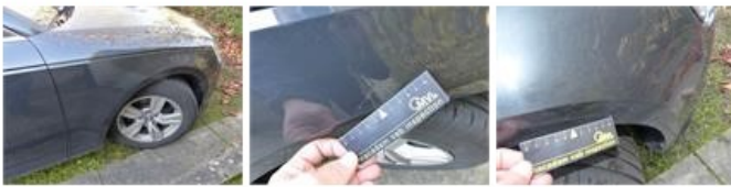
Bumper F R, Scratch(es), It - Spot repair